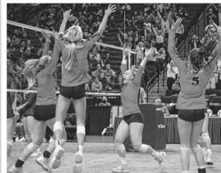
Mayer Lutheran players erupted in celebration after the final point in a three-set sweep of Minneota in Saturday's Class 1A championship match in St. Paul.