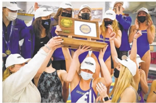
Minnetonka won the Class 2A girls' swimming state meet Saturday, raising the trophy for the first time since 1976.

SWIMMING AND DIVING CLASS 2A STATE FINALS