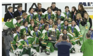
Girls Class 2A Champs - Hornet's