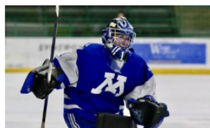
YHH Final Staff Rankings (GIRLS):