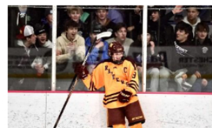
YHH Staff Rankings (GIRLS):