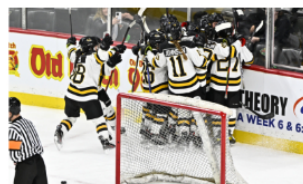
Girls Class 1A Champs - Warroad 3